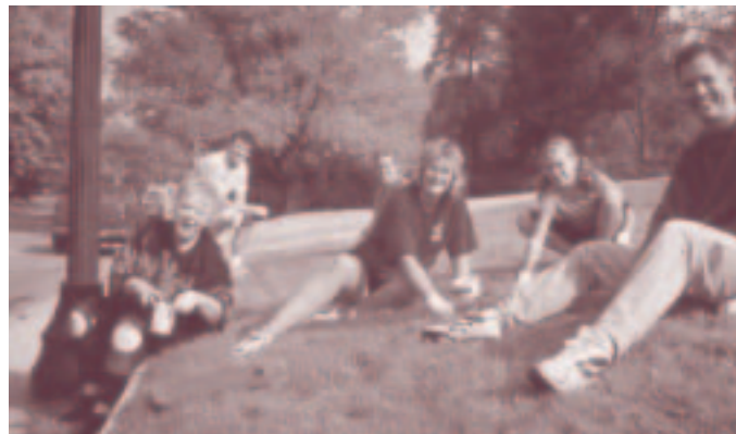
Hard at Work at 9:00 a.m. on a Saturday